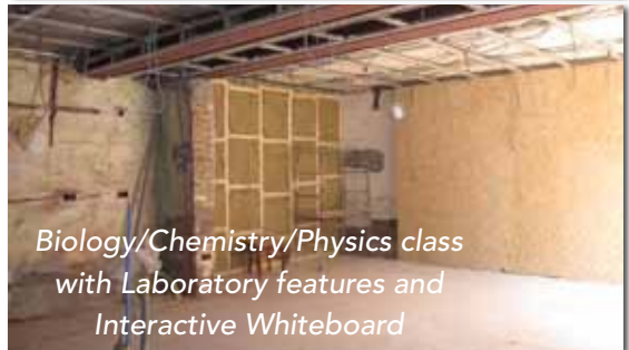
Biology/Chemistry/Physics class with Laboratory features and Interactive Whiteboard