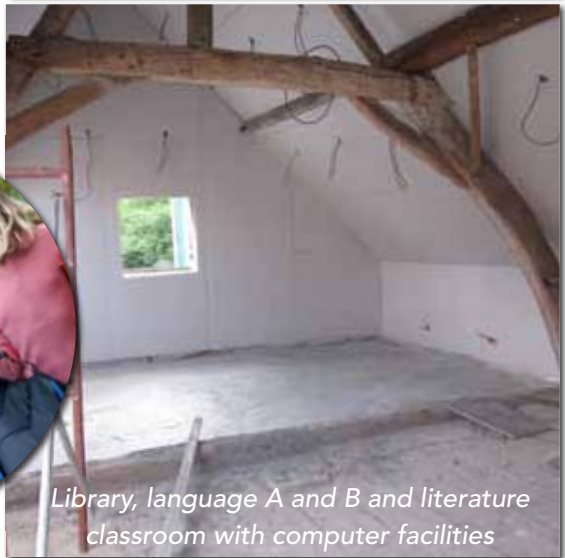
Library, language A and B and literature classroom with computer facilities