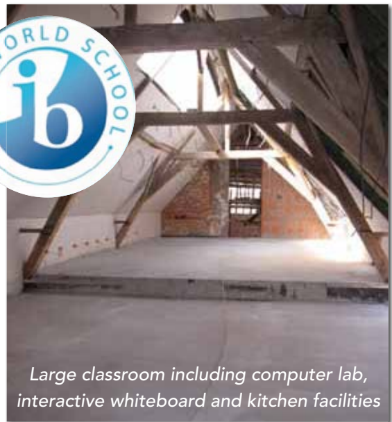
Large classroom including computer lab, interactive whiteboard and kitchen facilities